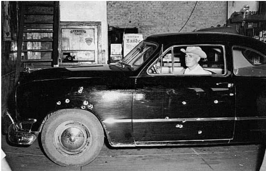
southland bullet holes