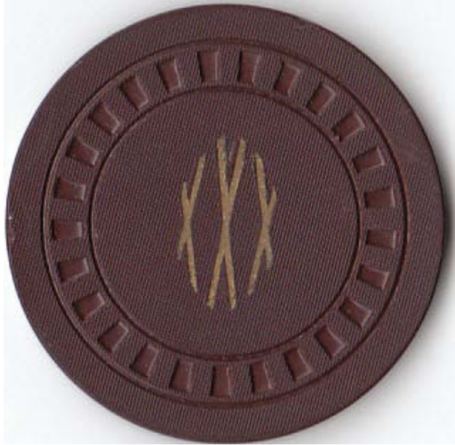
XXX barnett att 2

When Barnett ordered the chips he was one of the operators of a very popular night club in San Antonio called "Shadowland." Shadowland was raided several times for gambling and Barnett was one of the operators fined (Texas Rangers involved in some of the raids). However, the address the chips were sent to was not the address of Shadowland and I haven't been able to determine what was at 222 1/2 Travis.