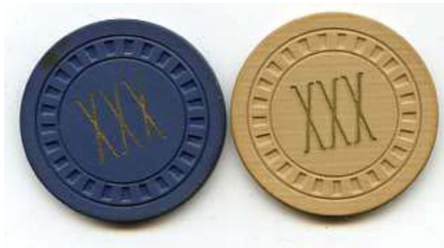
17866 att 2