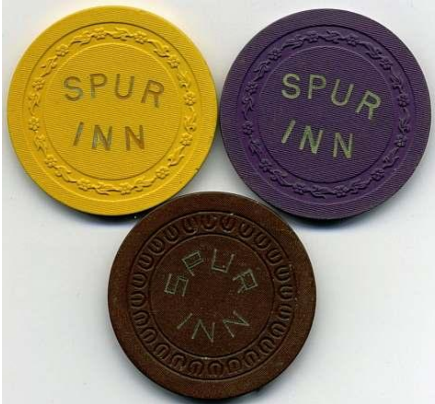
1 Spur Innatt2

I do not have the purple flower mold. The sellers only had 4 of them.