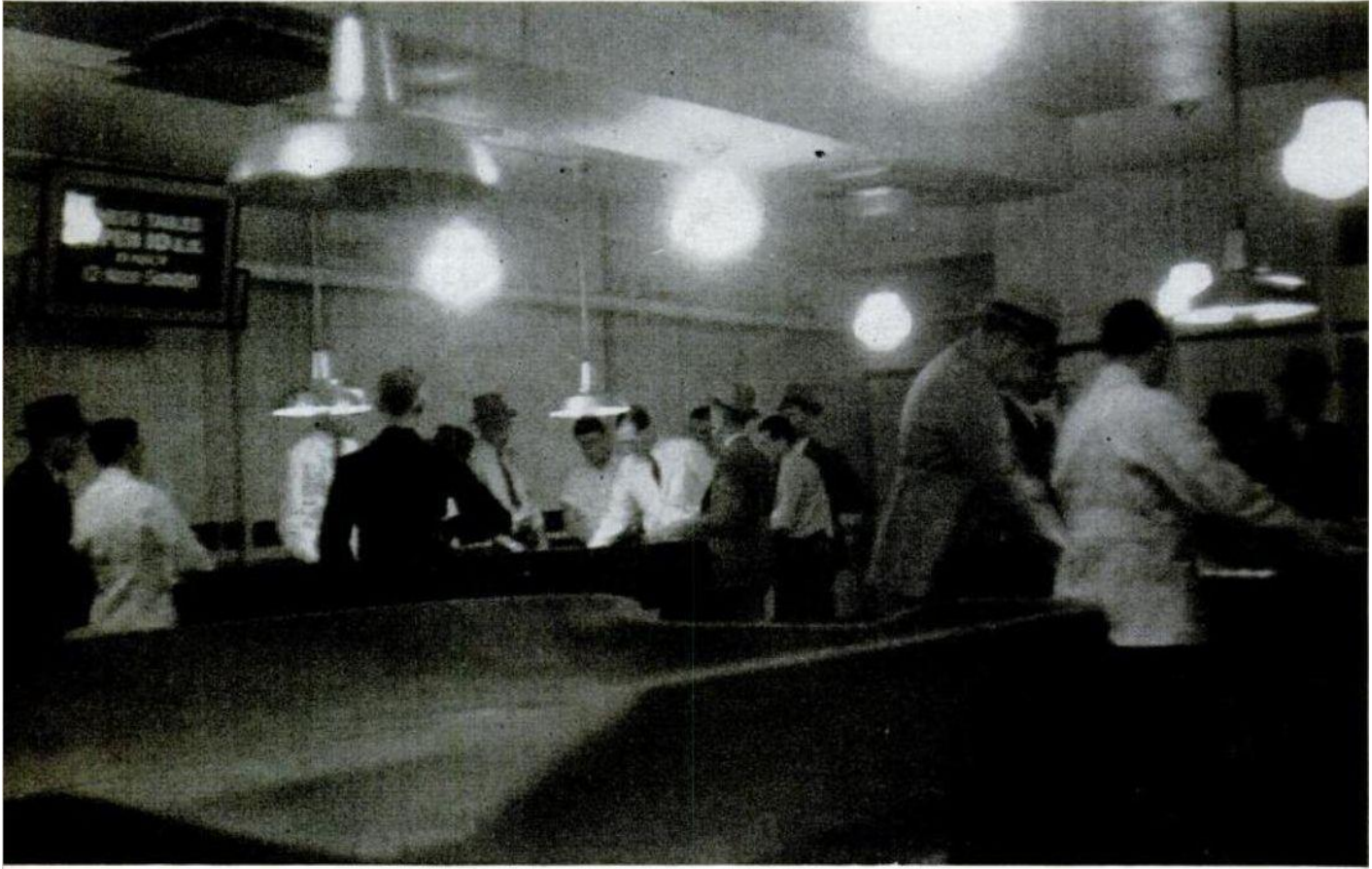
Crapshooting , the specialty of the house, at the Twelfth Street Recreation, 121½ East Twelfth St.

What say ye, Indiana boys? Are you satisfied? <g>