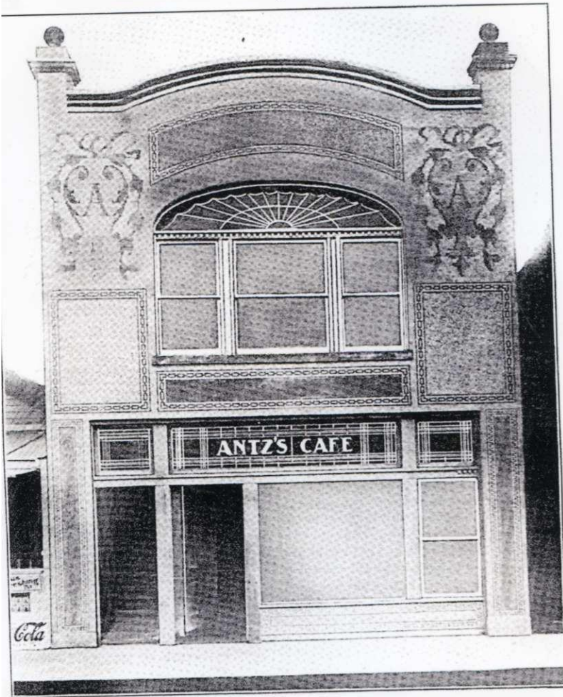
Exterior Mosaic Work Executed by The American Mosaic and Tile Co., Louisville, Ky