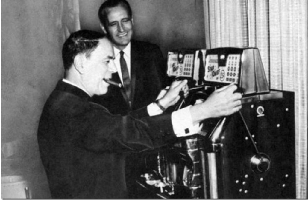
Inter Caribe 6