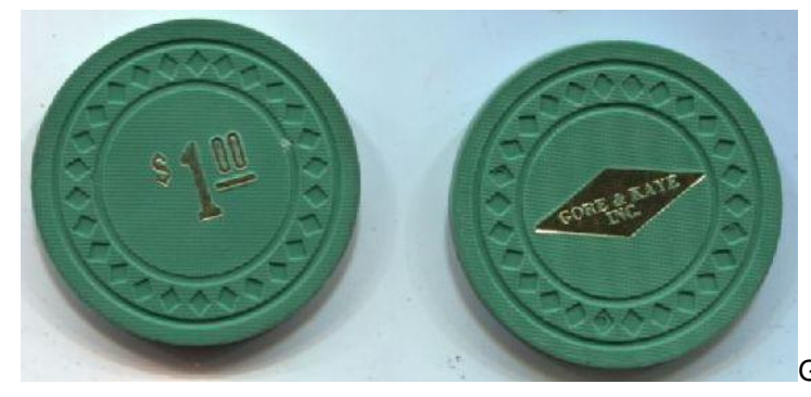
Gore and Kaye1att2

Actual chips leased in the charity operations. They are injected molded clay/plastic chips but I have no clue who made them or when they were made. They do not go back to the Jack Todd diamond mold era.