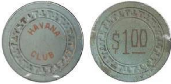
1 Havana Clubatt2