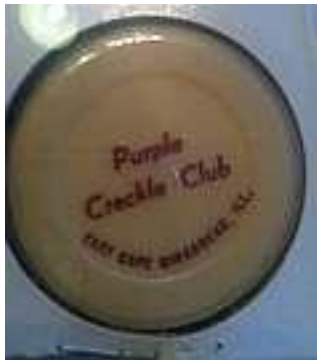
1 Brett Final 9

Do we want to call this a "Jetton" or a plastic chip? Either way, there is no doubt where it was used. *vbg*