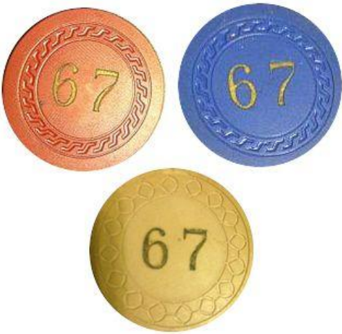
1 Brett Final 3

The CR Skey chip was taken in a raid by Brantley but no club name in his notes. The CR chip is in TGT as Club Royal, East Cape Girardeau, IL. Club Royal was actually in Bellevue, IL 100 miles to the north.