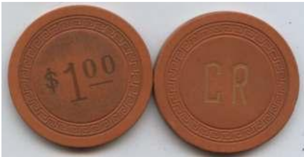
1 Brett Final 4

The CR Skey chip was taken in a raid by Brantley but no club name in his notes. The CR chip is in TGT as Club Royal, East Cape Girardeau, IL. Club Royal was actually in Bellevue, IL 100 miles to the north.