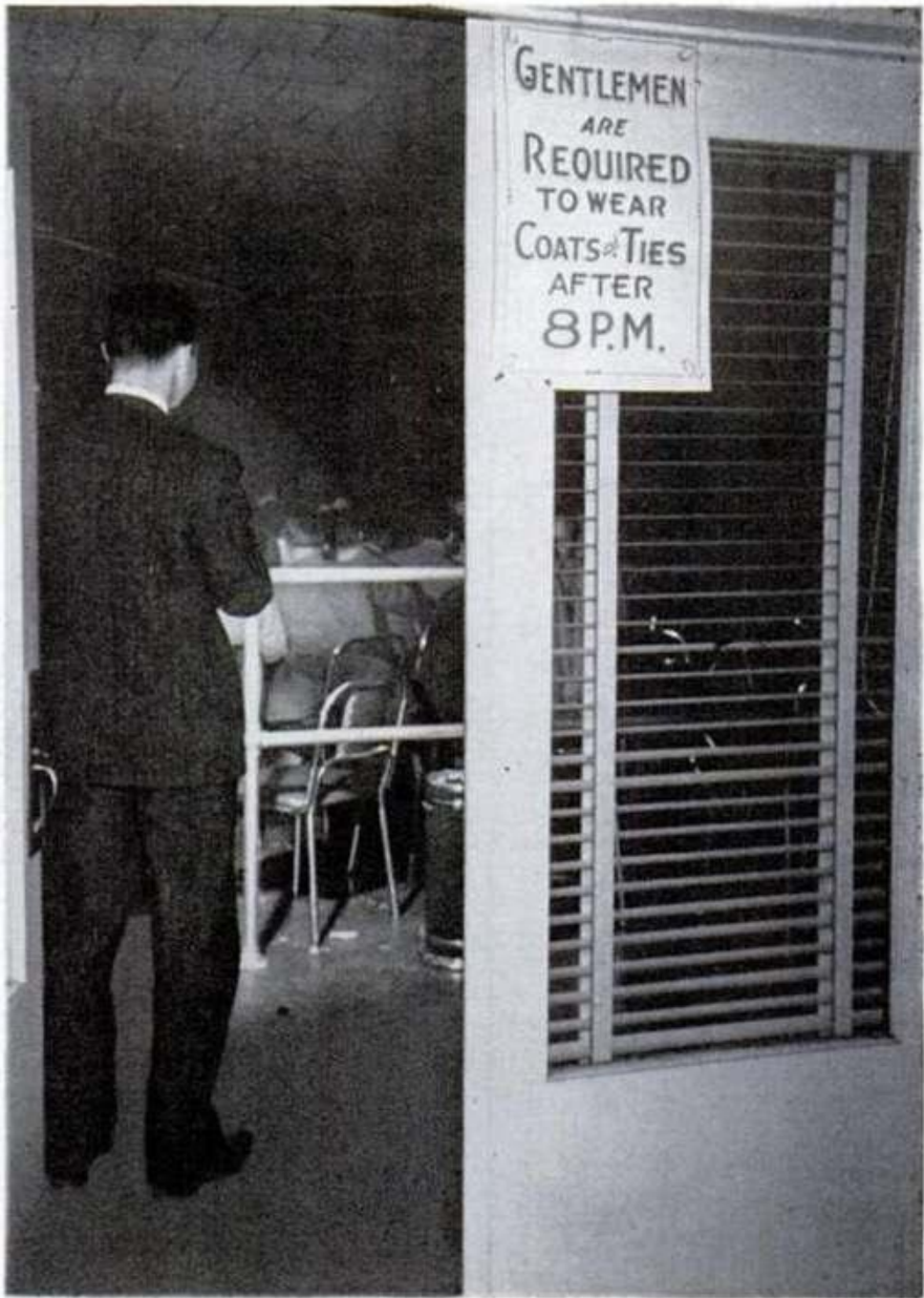
The Paramount Club , like all of Centralia's oases, is jammed nightly with happily oiled petroleumfolk. It fastidiously frowns on shirt sleeves and naked collar buttons.