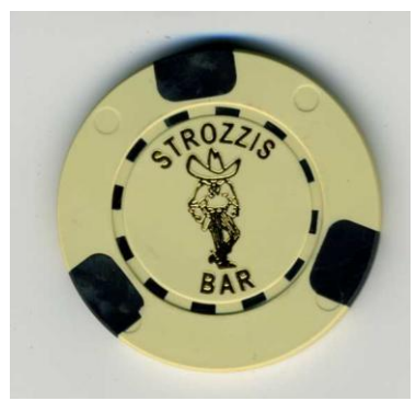
July 3rd 1974: