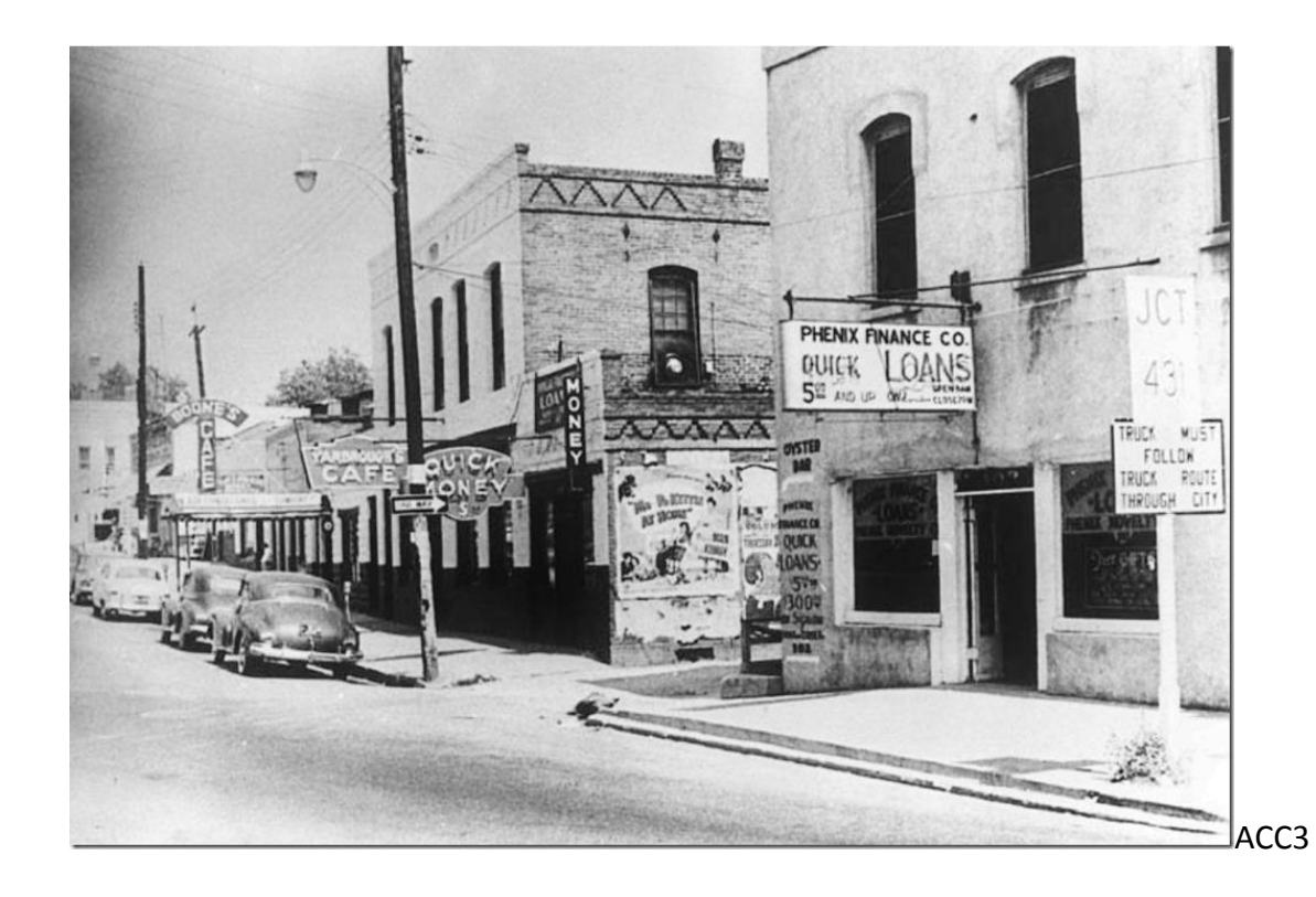
pic after the National Guard showed up: