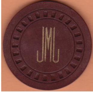
1 JML2 att2