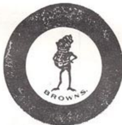
The Brown Casino