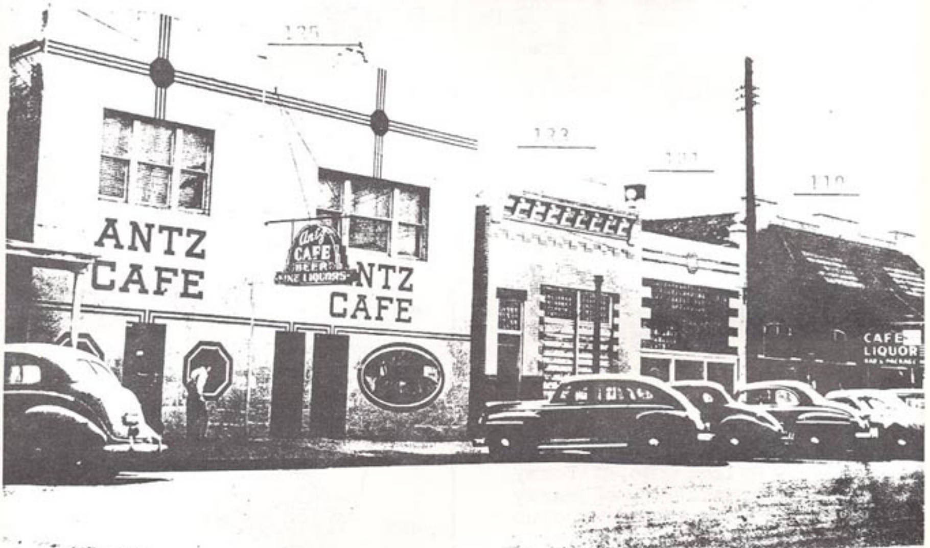
119 - 125 Court Avenue in the 1940's