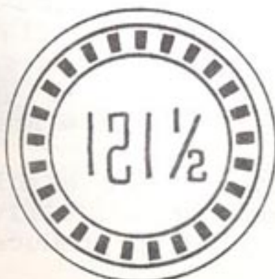
121 1/2 Club